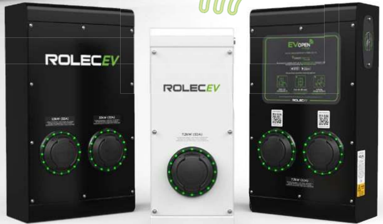
SECURICHARGE:EV SUPERFAST FREE TO USE 2way Charging Unit

Compatible with all EVs/PHEVs, the SECURICHARGE:EV provides Mode 3 fast charging in both 3.6kW and 7.2kW, as well as SuperFast 11kW and 22kW speeds.